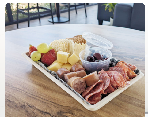
Mini platters for single serve