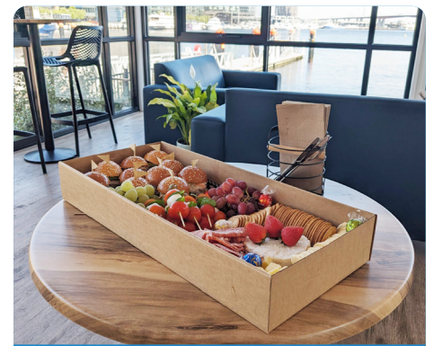
Larger platters for cocktail style